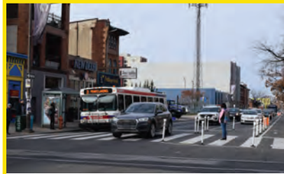
Painted areas with flexible delineator posts at key intersections will better delineate roadway space.