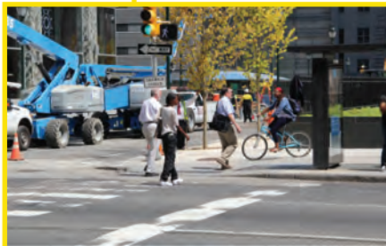
By installing a dedicated bike lane, bicyclists and drivers will be separated. This will reduce conflict between them and reduce biking on sidewalks.