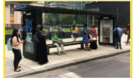
Upgraded bus shelters will improve the streetscape and make waiting for buses more comfortable.