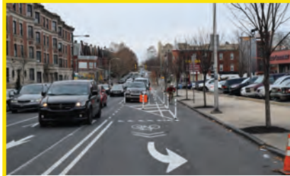
New turning lanes will help organize traffic and prevent unnecessary confusion at intersections.