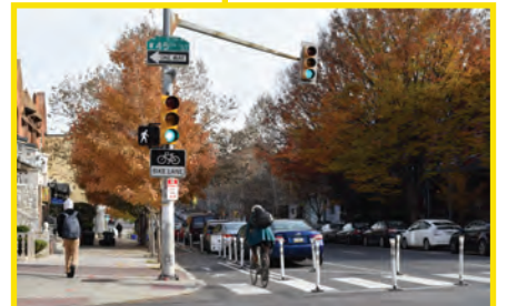
The parking protected bike lane will preserve parking and loading for residents, businesses, and visitors to Center City.

Please send comments and questions to: VisionZero@phila.gov